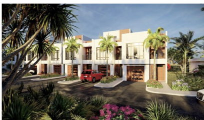
3 Buildings, 18 Townhomes