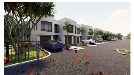
Your Quiet Suburban Oasis in The Shores