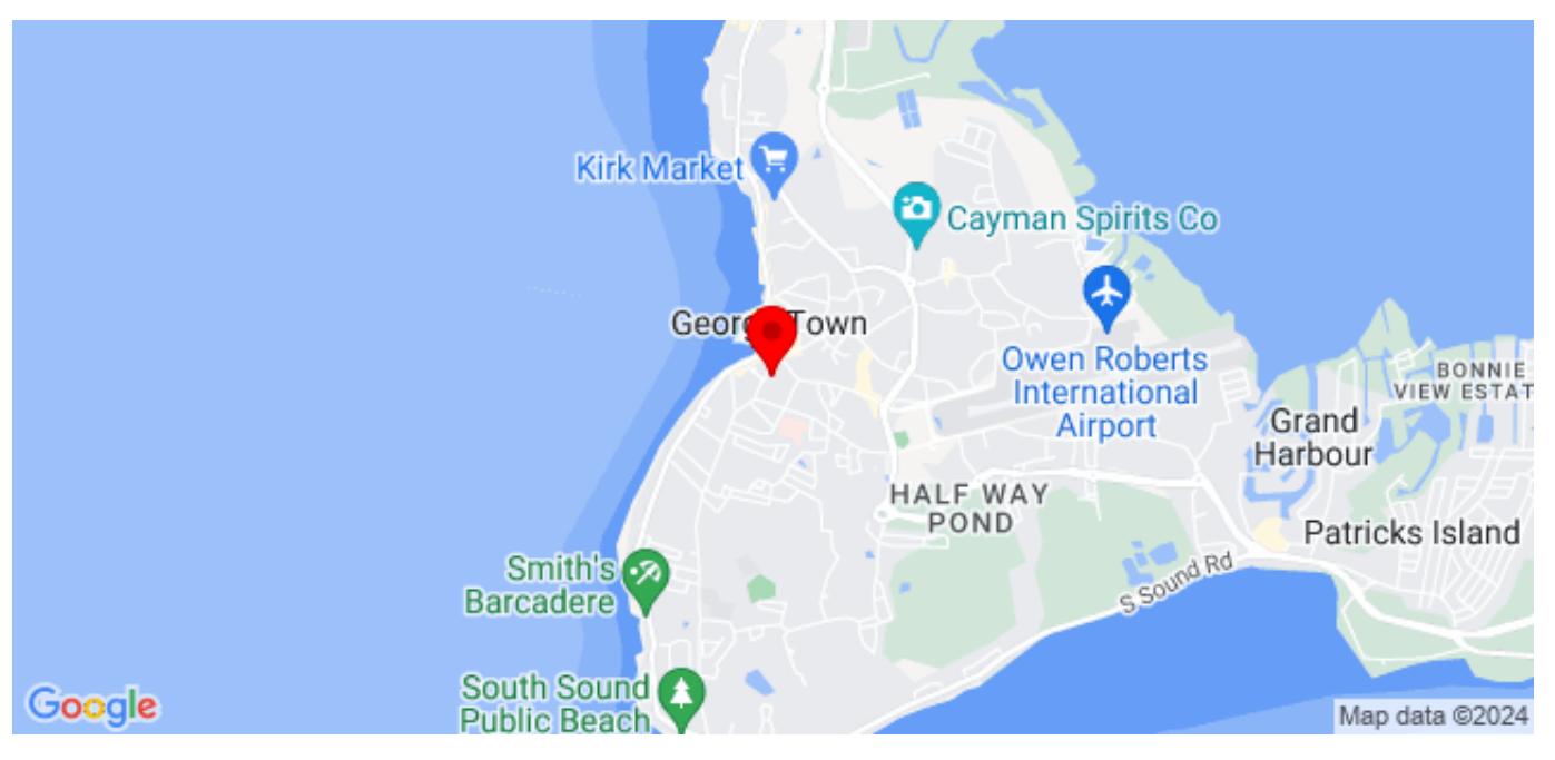
CIREBA MLS LDX feed courtesy of INTERNATIONAL REALTY GROUP

*Disclaimer: The information contained herein has been furnished by the owner(s) and or their nominee and represented by them to be accurate. The listing company, agent and CIREBA MLS disclaims any liability or responsibility for any inaccuracies, errors or omissions in the represented information. The listing details herein are also courtesy of CIREBA (Cayman Islands Real Estate Brokers Association) MLS and/or via LDX (Listing Data Exchange) feed. All the information contained herein is subject to errors, omissions, price changes, prior sale or withdrawal, without notice and is at all times subject to verification by the purchaser(s).