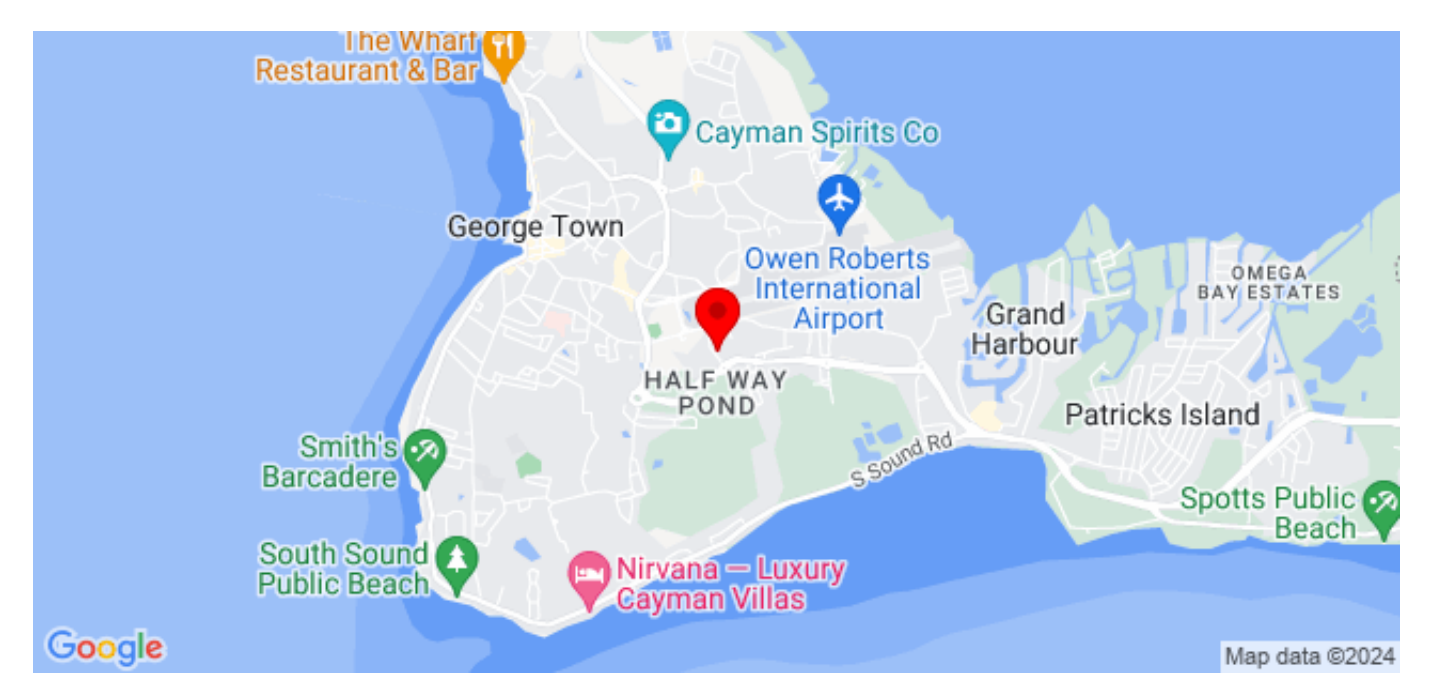
CIREBA MLS LDX feed courtesy of WILLIAMS2 REAL ESTATE

*Disclaimer: The information contained herein has been furnished by the owner(s) and or their nominee and represented by them to be accurate. The listing company, agent and CIREBA MLS disclaims any liability or responsibility for any inaccuracies, errors or omissions in the represented information. The listing details herein are also courtesy of CIREBA (Cayman Islands Real Estate Brokers Association) MLS and/or via LDX (Listing Data Exchange) feed. All the information contained herein is subject to errors, omissions, price changes, prior sale or withdrawal, without notice and is at all times subject to verification by the purchaser(s).