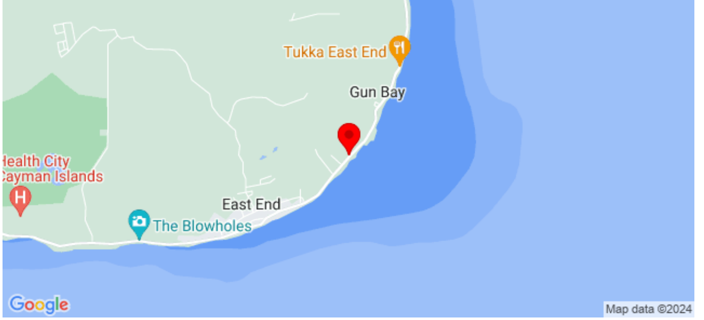
CIREBA MLS LDX feed courtesy of CAYMAN ISLANDS SOTHEBY'S INT'L REALTY

*Disclaimer: The information contained herein has been furnished by the owner(s) and or their nominee and represented by them to be accurate. The listing company, agent and CIREBA MLS disclaims any liability or responsibility for any inaccuracies, errors or omissions in the represented information. The listing details herein are also courtesy of CIREBA (Cayman Islands Real Estate Brokers Association) MLS and/or via LDX (Listing Data Exchange) feed. All the information contained herein is subject to errors, omissions, price changes, prior sale or withdrawal, without notice and is at all times subject to verification by the purchaser(s).