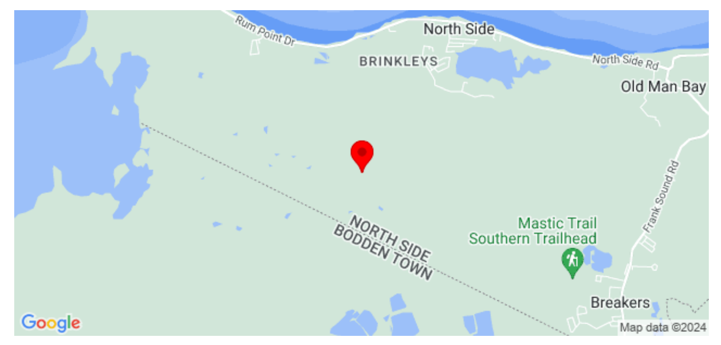
CIREBA MLS LDX feed courtesy of JBS PROPERTIES

*Disclaimer: The information contained herein has been furnished by the owner(s) and or their nominee and represented by them to be accurate. The listing company, agent and CIREBA MLS disclaims any liability or responsibility for any inaccuracies, errors or omissions in the represented information. The listing details herein are also courtesy of CIREBA (Cayman Islands Real Estate Brokers Association) MLS and/or via LDX (Listing Data Exchange) feed. All the information contained herein is subject to errors, omissions, price changes, prior sale or withdrawal, without notice and is at all times subject to verification by the purchaser(s).